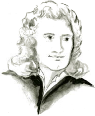
Isaac Newton Born: January 4, 1643 Died: March 20, 1726